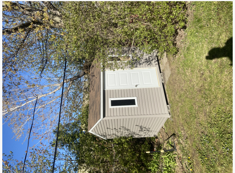
sheraz khan longueuil