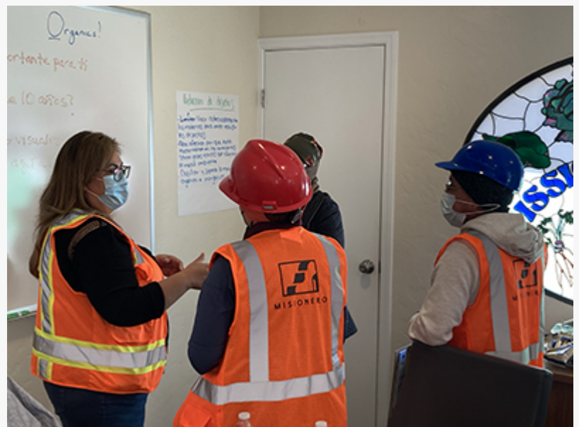
Produce & Reduce Team meeting at Misionero