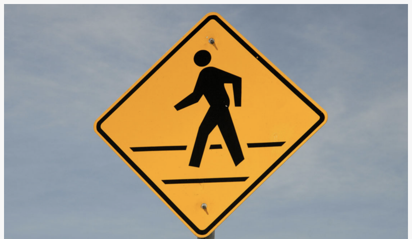
Crosswalks are there for a reason.