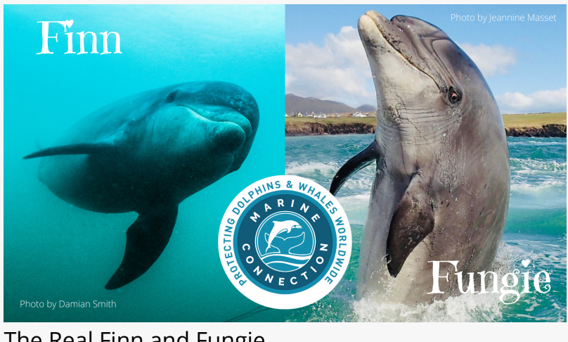
The Real Finn and Fungie

therefore helping to ensure freedom for all cetaceans for generations to come.