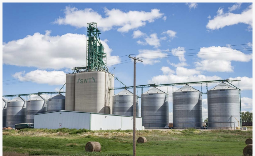
South West Terminal

In addition to seamless transactions, farmers have access to a range of innovative features at their fingertips, like the latest news, government reports, and weather - getting the inside scoop from seasoned marketing professionals to make informed decisions when buying and selling grain.