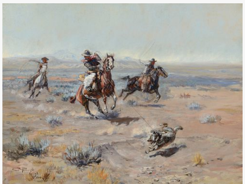
Charles M. Russell, Roping a Wolf (1904), Sold for $1,770,000 in Coeur d'Alene Art Auction's Fine Western & American Art Auction

NEW YORK, NY, UNITED STATES, August 10, 2021 /EINPresswire.com/ -- The Coeur d'Alene Art Auction brought a strong total of over $17.5 million during this year's sale. The highlight of the 2021 sale was auction mainstay Charles M. Russell's Roping a Wolf , 1904, which sold for over $1.7 million – the highest total for the influential Western artist in over seven years, and the tenth-highest total all-time. The largest single-auction event in the classical Western and American Art field saw over 30 lots eclipse the $100,000 price point, realizing a sales rate of over 94%.