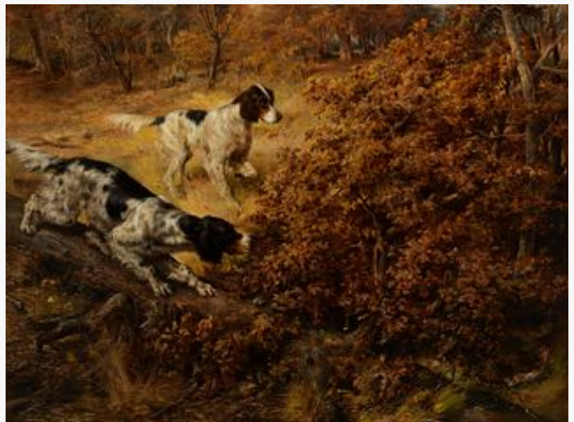
Edmund H. Osthaus, Two Hunting Dogs , 1891, Sold at Auction: $242,000, a World Record for Edmund H. Osthaus