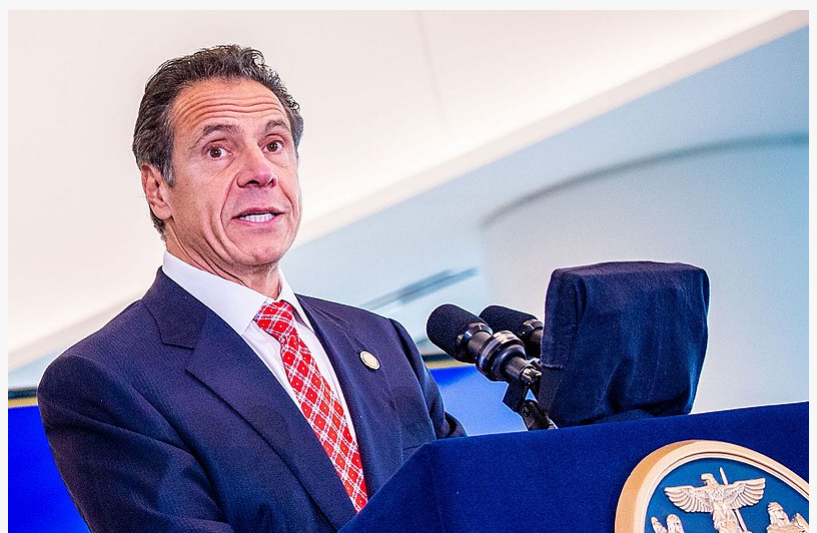
Andrew Cuomo speaks at the opening of new LGA terminal 2019.

Governor Cuomo on Tuesday announced his resignation as Governor of New York in the culmination of an investigation by the New York State Attorney General , validating sexual assault allegations against him. This avoids an impending impeachment trial in the Assembly that would focus on these allegations, as well as other wrongdoings during his administration, including mishandling of nursing home patients related to the COVID-19 pandemic, financial improprieties surrounding his book deal, and structural deficiencies on the bridge formerly known as the Tappan Zee, now named after his father.