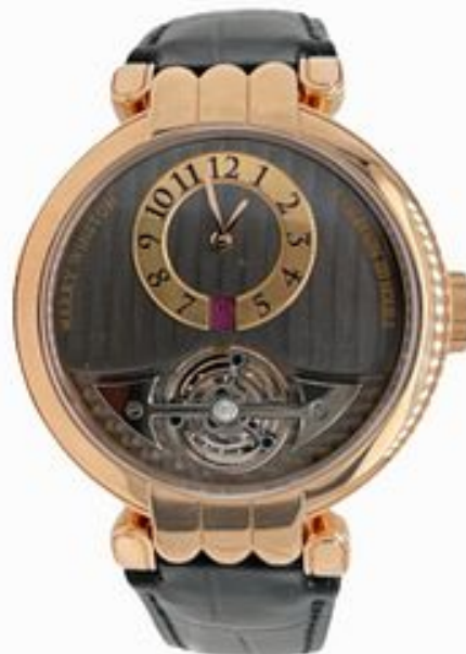
Harry Winston Watch (retail $125,000)