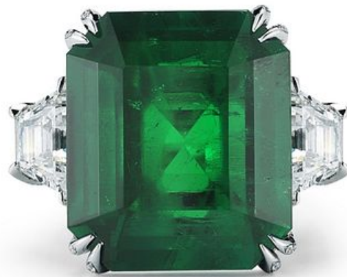
Rare And Unique Zambian Emerald And Diamond Ring