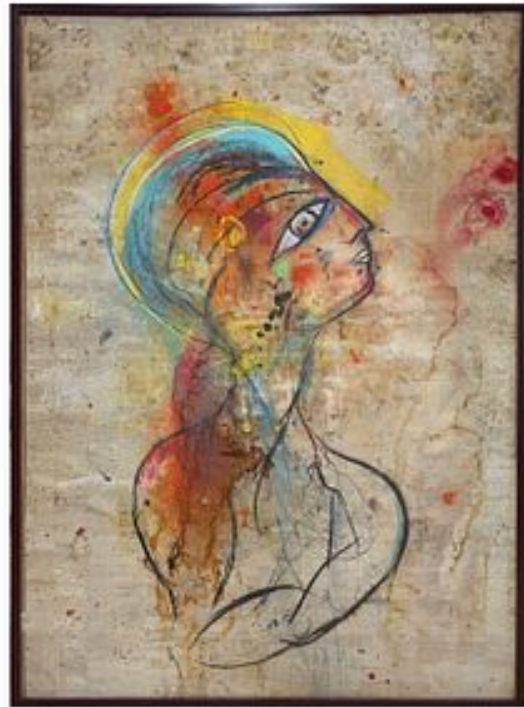
Jamali (Pakistani, b. 1947)