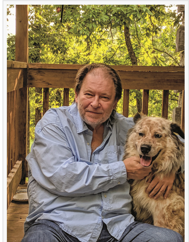
Rick Bragg

Shown here are author Rick Bragg and his dog, Speck, the central figure in his new book, The Speckled Beauty .