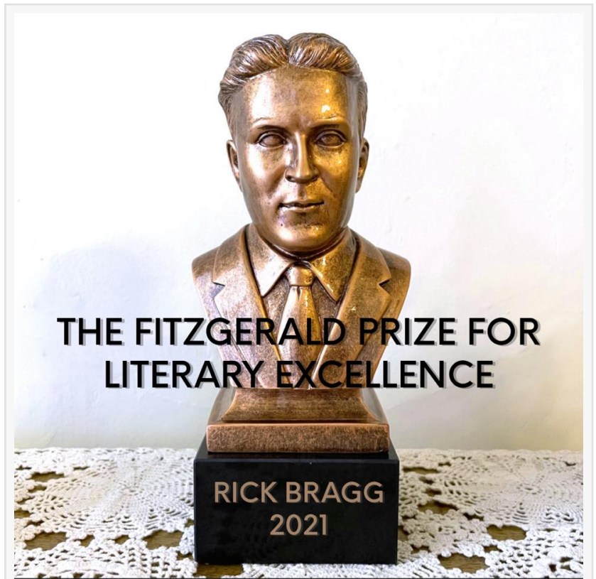
The Fitzgerald Literary Prize trophy is a bronze bust of F. Scott Fitzgerald.