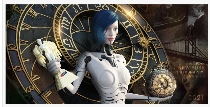
New York Photography Awards - Calling For Entries

the wonders of the world through their lenses and perspectives, whilst concurrently delving deeper into the roots of New York and discover the beauty it holds."