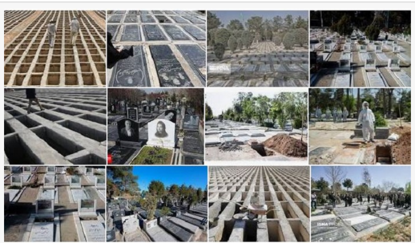
(NCRI) and (PMOI / MEK Iran): Behesht-e Zahra Cemetery's CEO, The COVID-19 mortality peak in Tehran is rising steeply.

The highest such stat was previously reported on April 26, standing at 496 coronavirus casualties. The official statistics show the number of 40,808 cases on August 9, which is record-breaking.