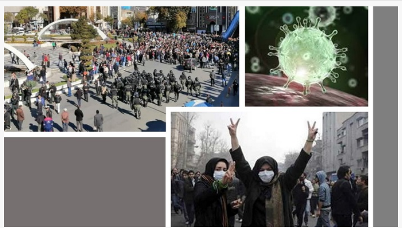
(NCRI) and (PMOI / MEK Iran): Following the mass November 2019 protests with calls for regime change, the regime implemented its inhumane Covid-19 policy to manage Iran's restive society.

When people barely have anything to eat, they spend all their time working endlessly in grief