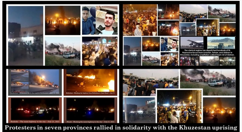
(NCRI) and (PMOI / MEK Iran): Recent protests in Khuzestan and a slew of other places demonstrated that the regime's cruel Covid-19 policy would no longer be a deterrent to popular insurrection.