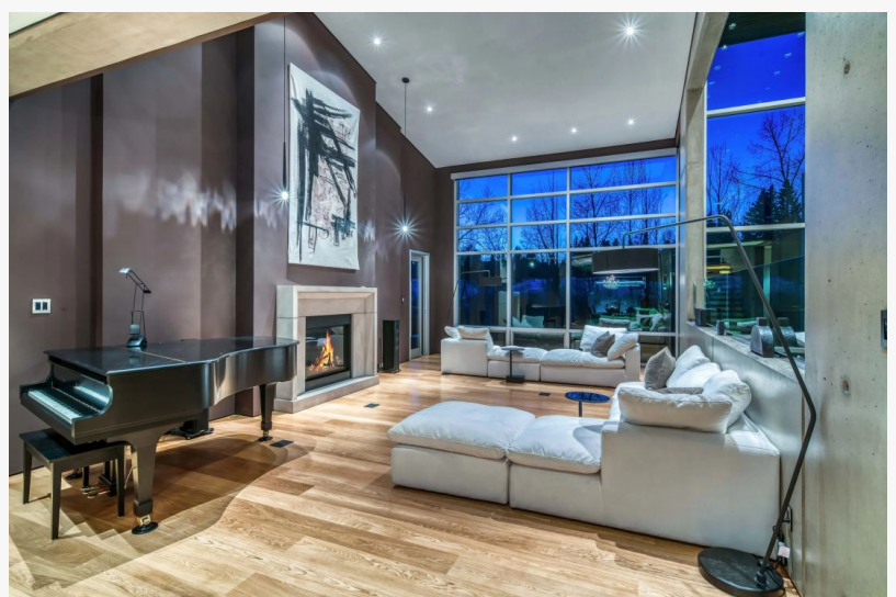
10ft+ vaulted and barreled ceilings and designer finishes

As part of Concierge Auctions' Key for Key® giving program in partnership with Giveback Homes, the closing will result in a new home built for a family in need.