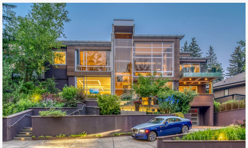
Overlooking Cartier Park in prestigious Upper Mount Royal

/EINPresswire.com/ -- Overlooking Cartier Park, 2906 Marquette Street Southwest will auction this month via Concierge Auctions in partnership with Mark D. Evernden and Lee Richardson of Century 21 Bamber Realty. Currently listed for $10.89 million CAD, the property will sell No Reserve to the highest bidder. Bidding is scheduled to be held on September 10–15 via Concierge Auctions' online marketplace, ConciergeAuctions.com , allowing buyers to bid digitally from anywhere in the world.