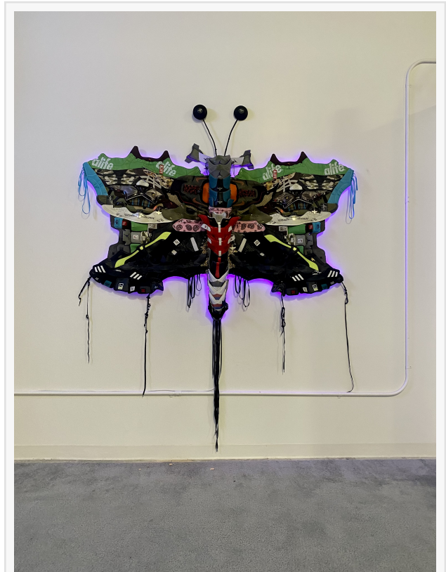
"Sneakerfly" A replication of one of Mother Natures beautiful and delicate creations the butterfly has been re created in nearly 40 pairs of vintage and classic sneakers from some of the worlds most recognisable brands. Hand cut and arranged by B

Rousseau is also an exhibitor and dissected multiple, classic, vintage sneakers to create a