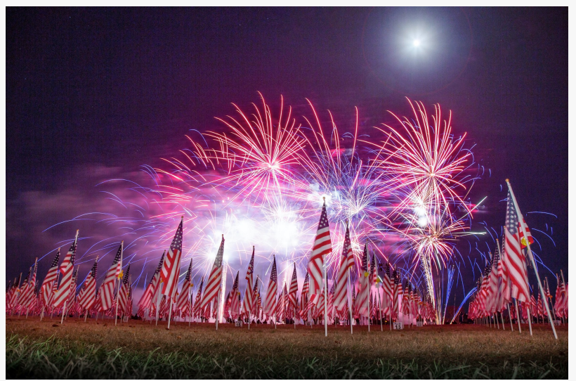
Exchange Club of Donelson-Hermitage's 6th Annual Field of Honor® (Veterans Day)