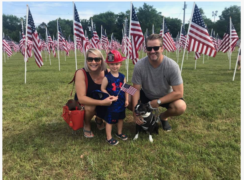
Exchange Club of Murfreesboro’s 13th Annual Healing Field® (Memorial Day)