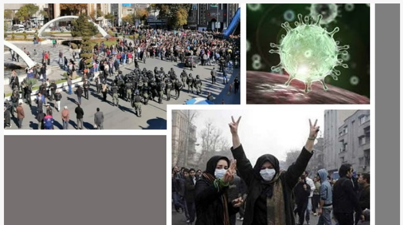
(PMOI / MEK Iran) and (NCRI): Following the mass November 2019 protests with calls for regime change, the regime implemented its inhumane Covid-19 policy to manage Iran's restive society.