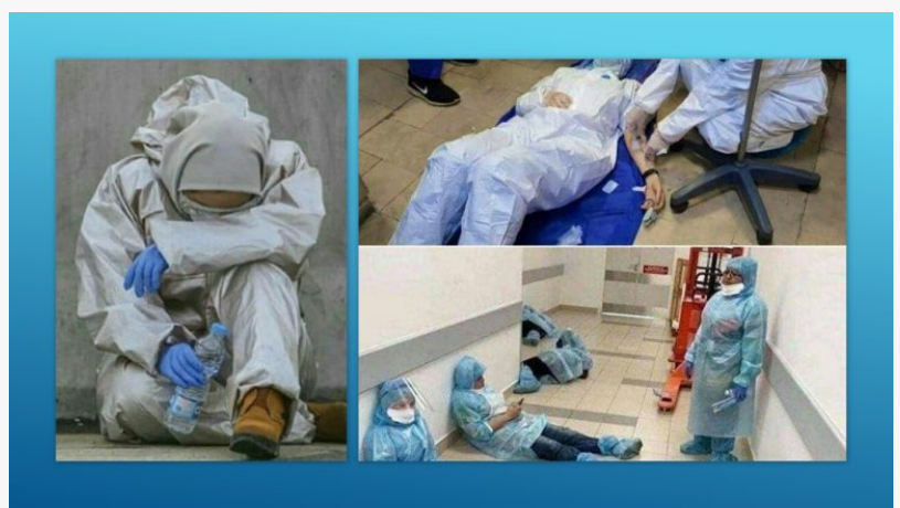
(PMOI / MEK Iran) and (NCRI): Nurses and Doctors in hospitals are under tremendous pressure due to hard work in the coronavirus crisis in Iran.

While the lack of COVID-19 medicine and vaccination due to inhuman policies of the regime is a bitter reality in Iran, Ebrahim Raisi continuing the lies of his predecessor, Hassan Rouhani, claimed, today, "There is