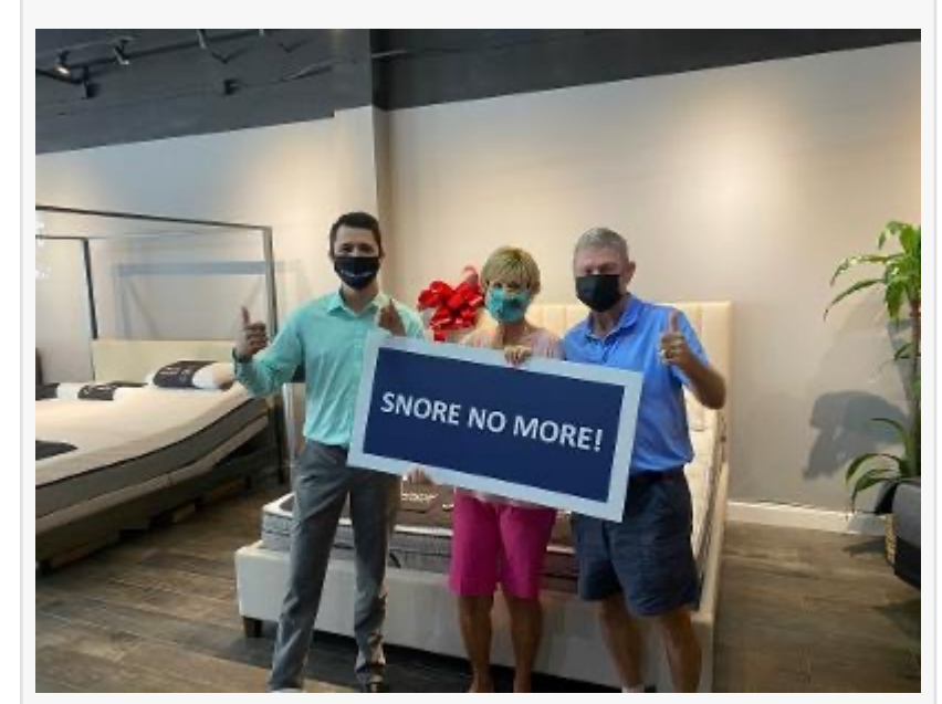
We Love Our Customers

For over 53 years Relax in Comfort has helped people to sit, sleep and feel better every day and our mission remains to help people live a more comfortable place!