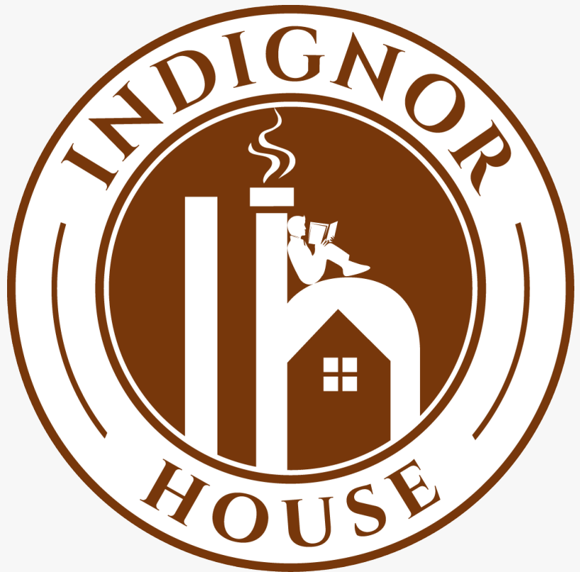
Indignor House Publishing