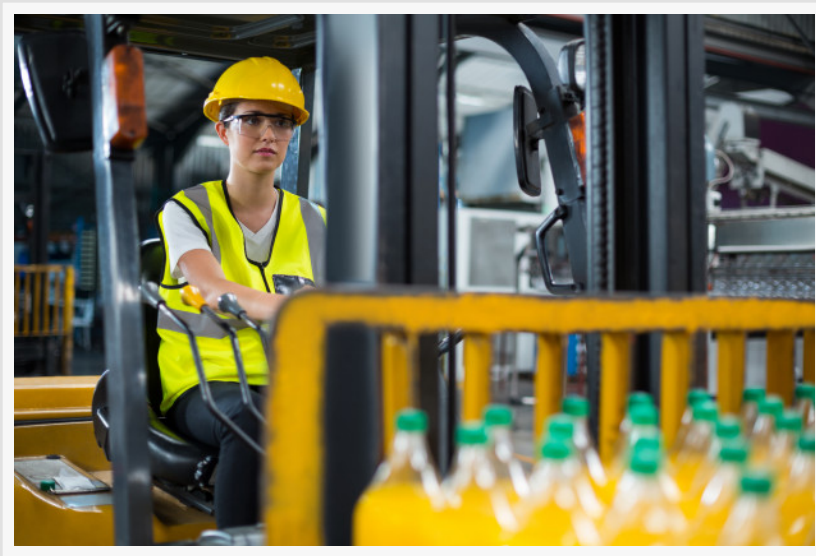
Female Driving A forklift

With companies increasing production and more materials are being added to warehouses, forklift safety should be the #1 priority. Tighter spaces means forklift operators are being pressured to deliver the materials to production at a greater rate than before. warehouse layouts are key to forklift safety as with more blind spots in the warehouse the more likely an accident can occur.