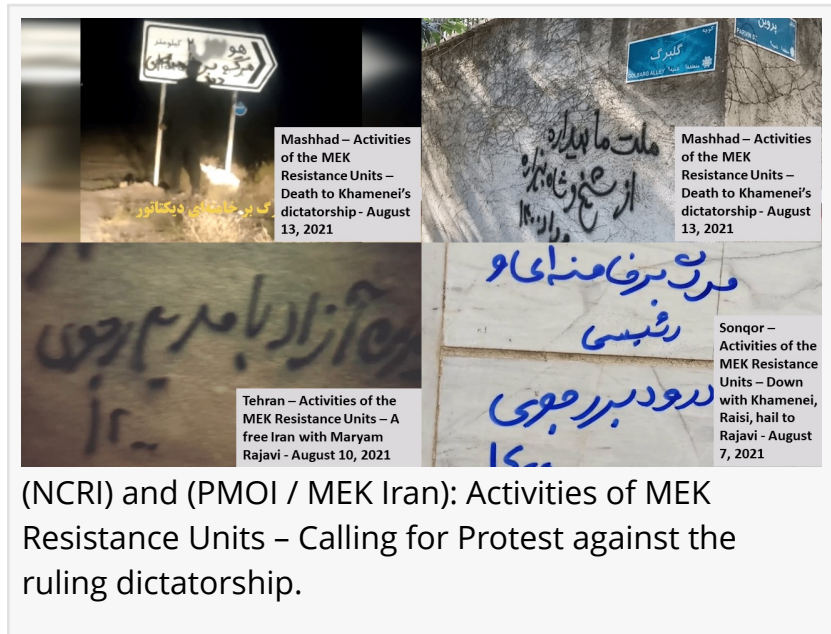
(NCRI) and (PMOI / MEK Iran): Activities of MEK Resistance Units – Calling for Protest against the ruling dictatorship.

and distributed leaflets throughout Iran to spread messages from the Resistance leadership about the appointment and inauguration of Ebrahim Raisi as president.