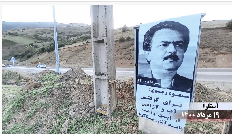
(NCRI) and (PMOI / MEK Iran): Astara – Activities of the MEK Resistance Units - August 13, 2021.

"Let's not leave the rebellious youth in Khuzestan alone."