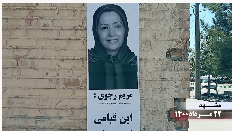
(NCRI) and (PMOI / MEK Iran): Mashhad – Activities of the MEK Resistance Units – August 13, 2021.