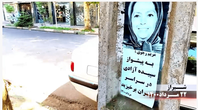
(NCRI) and (PMOI / MEK Iran): Shiraz – Activities of the MEK Resistance Units – Maryam Rajavi Rise to bring freedom to Iran - August 13, 2021.