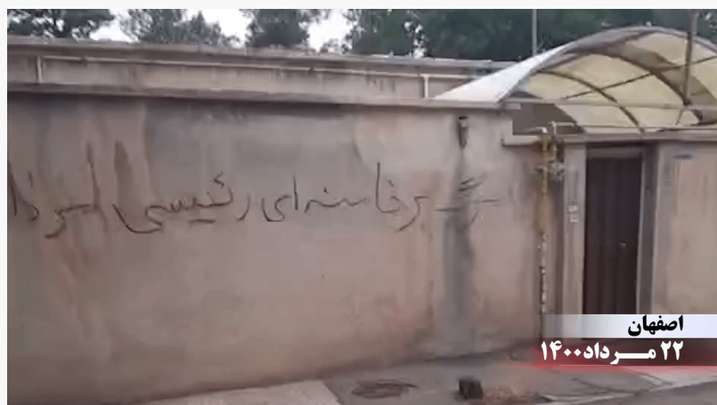
(NCRI) and (PMOI / MEK Iran): Isfahan – Activities of the MEK Resistance Units –Down with Khamenei, Raisi- August 13, 2021.