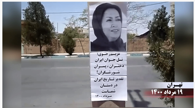
(NCRI) and (PMOI / MEK Iran): Tehran – Activities of the MEK Resistance Units – Maryam Rajavi Iranian youth, Iran's destiny is in your hands - August 10, 2021.

This press release can be viewed online at: https://www.einpresswire.com/article/548903964