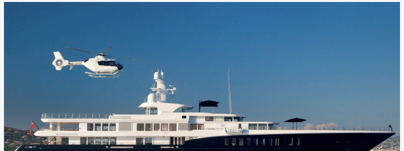
Cabo Platinum - Ultimate Package

orchestrated by an industry leading villa rental and destination management company, Cabo Platinum. Their package is currently focused in Los Cabos, Mexico, although they are working with partner alliances in select international markets.