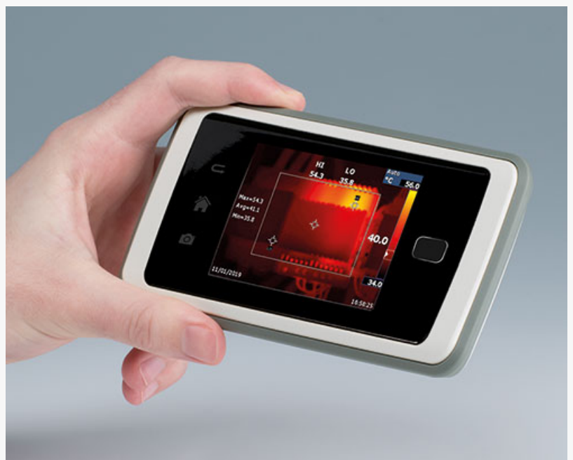
SLIM-CASE is also designed for mounting touch screens