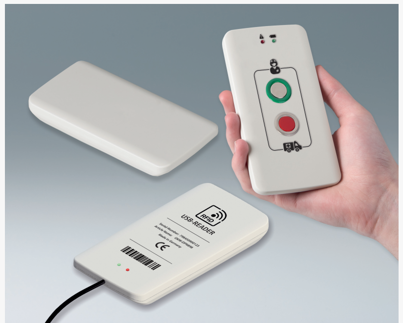
SLIM-CASE with smooth top for push-buttons and keypads

Ergonomic SLIM-CASE (IP 54/65) is the new-generation handheld enclosure for mobile measuring and control applications, wireless communications, IoT/IIoT, healthcare, laboratories, offices, safety engineering and environmental technology.