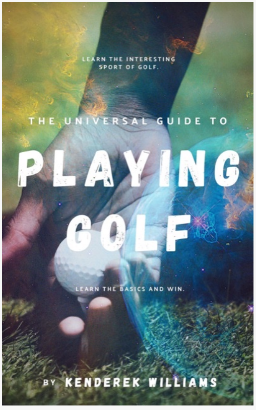
The Universal Guide to Playing Golf Book

Discover your potential with Clyde Publishers at ClydePublishers.com and register on the site to get started.