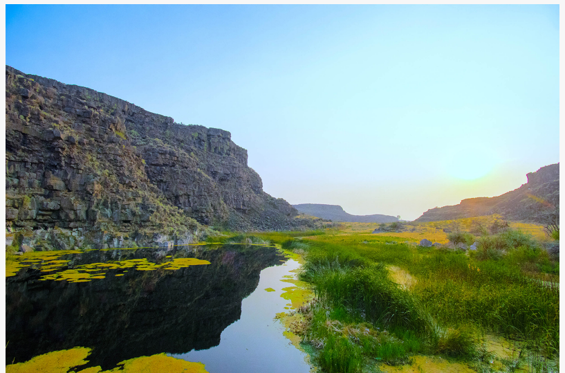
Surrounded by Snake River and 8,000 acres of protected land