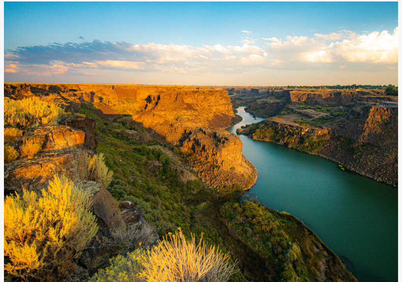
Devil's Corral, Snake River, Idaho

The property will sell with no Reserve to the highest bidder. Bidding is scheduled to be held on September 16–21st, via the firm's digital marketplace, ConciergeAuctions.com , allowing buyers to bid remotely from anywhere in the world.