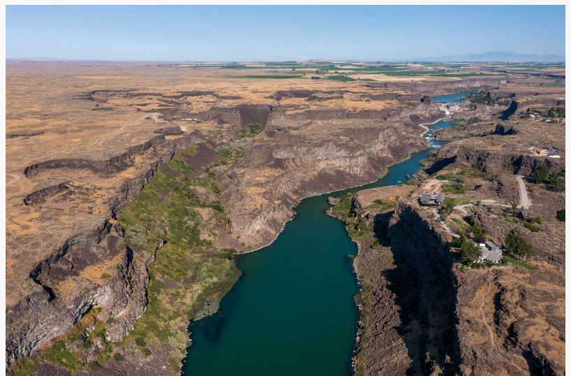
197 pristine acres of canyons, rivers, and streams

"No one could have predicted the growth we have seen in Idaho the last few years. Relocating to Idaho means a clean, safe environment, lower priced homes and lower property taxes. Being the fastest growing state in the nation has led to a shortage of homes and land, and the availability of Devil's Corral at this time creates an amazing