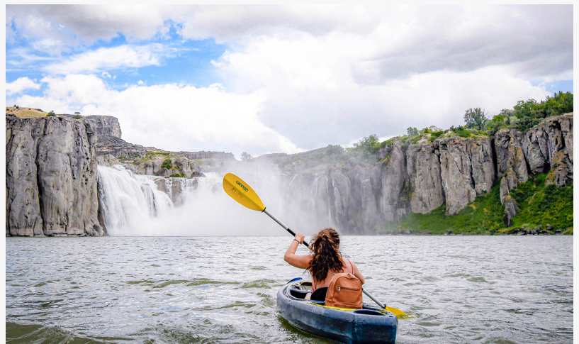
Endless recreation, including rock climbing, BASE jumping, kayaking, fishing, hiking and more