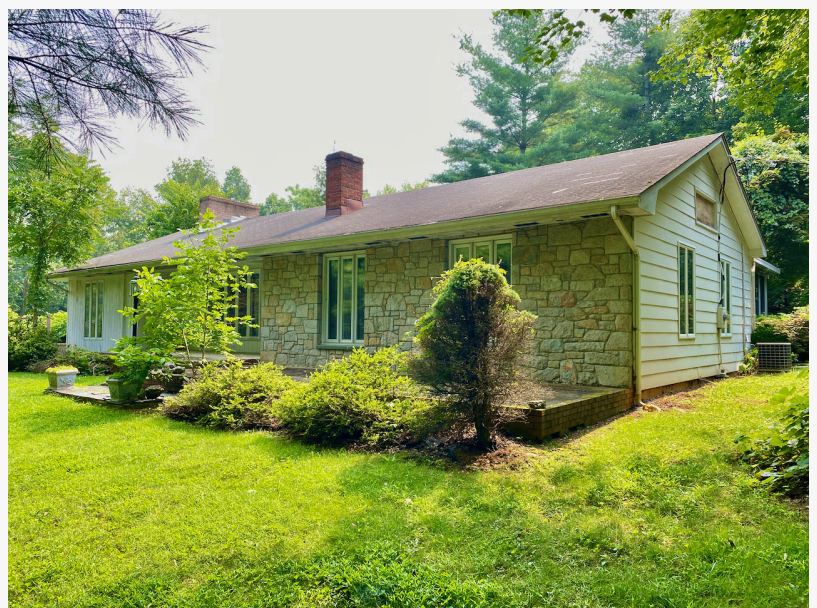
11070 Harpers Ferry Rd., Hillsboro, VA