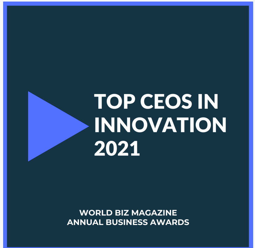
World Biz Magazine - Top 100 Innovation CEOs