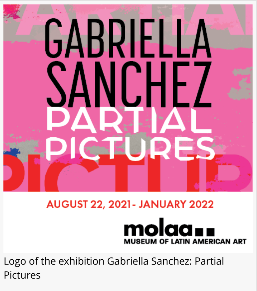
Logo of the exhibition Gabriella Sanchez: Partial Pictures

"Through the connection of the power of words, linking with photographs as a fragment of reality and an imaginary of identity and memory, the artist chooses and develops an intimate