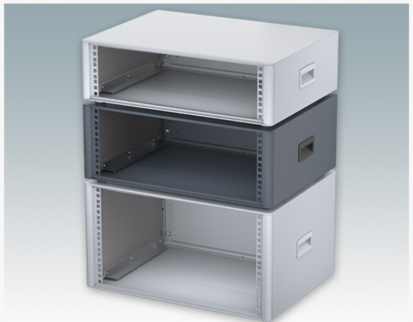
TECHNOMET is also available in 19" wide versions (3U to 6U)

This press release can be viewed online at: https://www.einpresswire.com/article/549067453