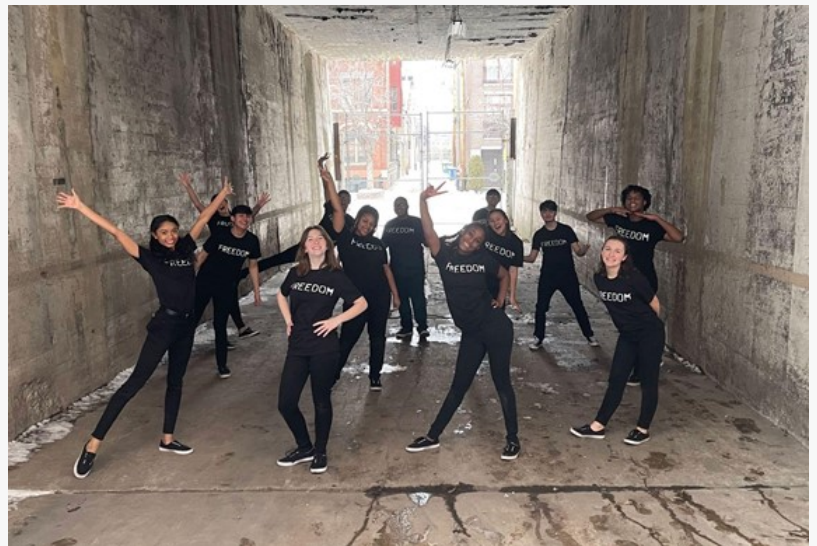
Chicago Children's Choir Black History Month concert series.

The robust performance schedule kicks off with Chicago's most inspirational gala, Red Jacket Optional, in person at The Geraghty (2520 S. Hoyne Ave.) on October 16, 2021. As in recent years, the gala's exciting performances will be broadcast online. In addition to the revival of Songs of the Season with a cohort of alumni for this milestone year and the in-person return of the Black History Month