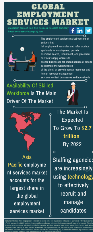
Employment Services Global Market Report 2021