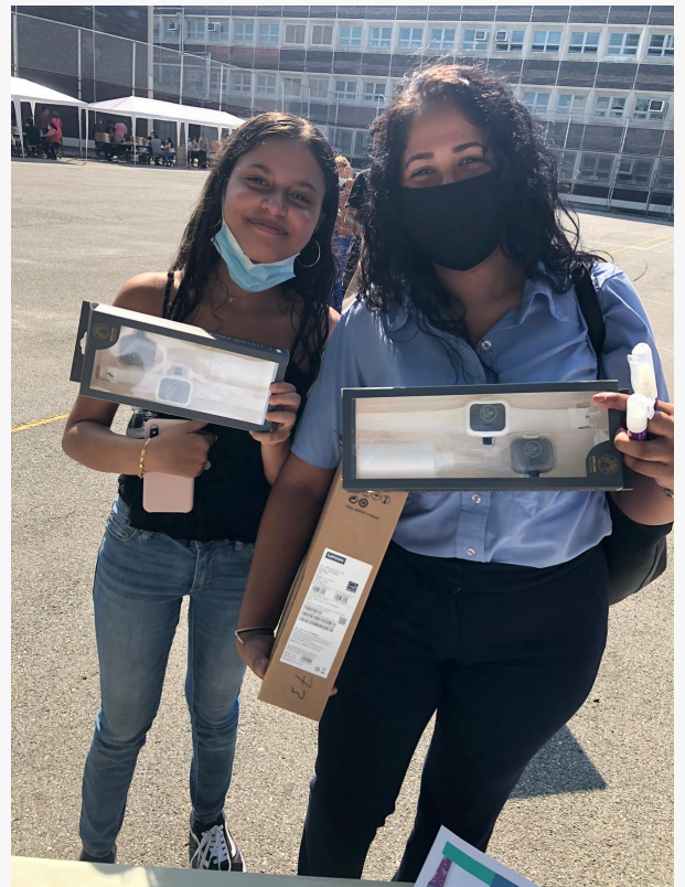
Donation to a school in the Bronx