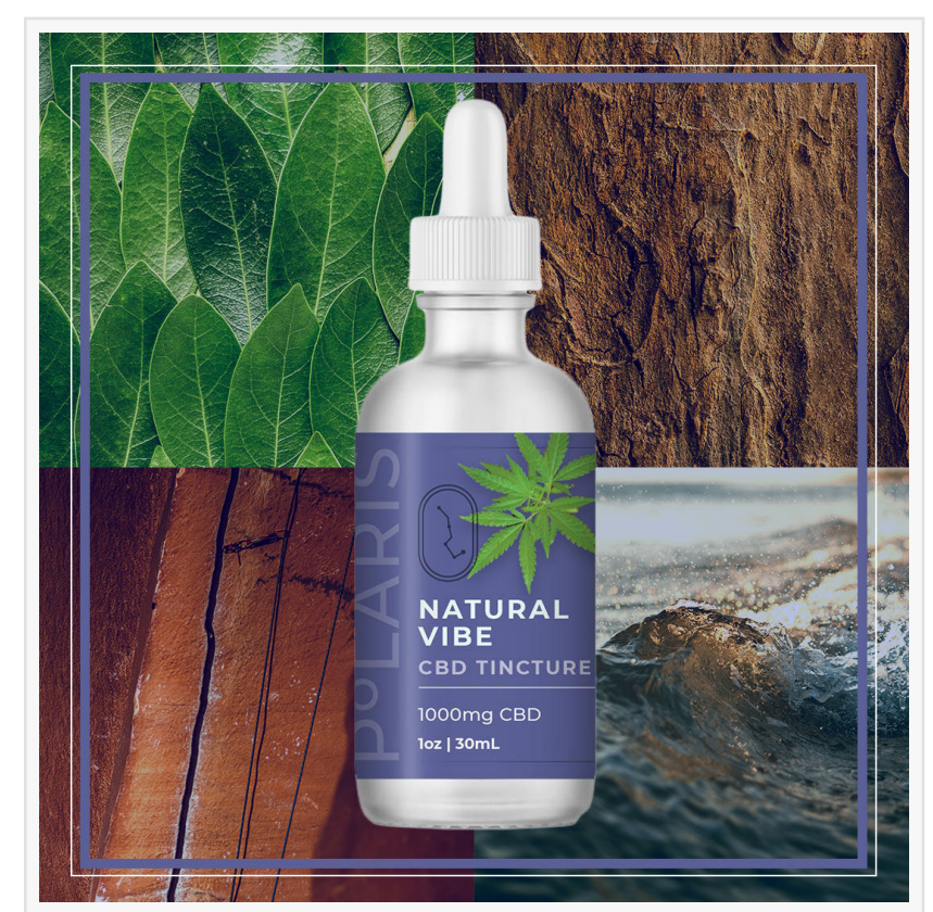
Polaris' Certified Organic farming practices are beneficial to both consumers and the environment.

The most significant obstacle for today's CBD manufacturers is cost. Many manufacturers use non-organic denatured ethanol, meaning that it's tainted with poison and unfit for consumption. That's because organic food-grade ethanol carries a heavy price tag, and not many companies are willing to invest in the long-term health of their customers. As a family-oriented brand based on honest manufacturing methods, Polaris