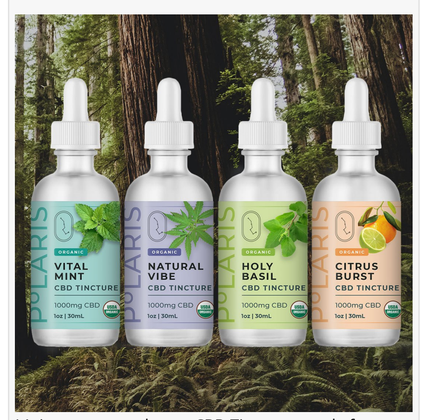
It's important to choose CBD Tinctures made from high-quality organic hemp to ensure expected results.