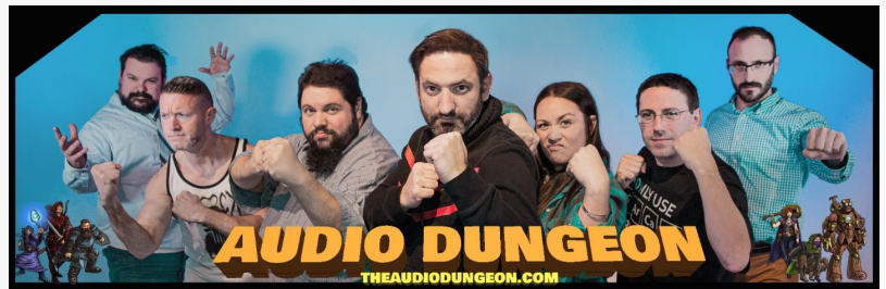
The Audio Dungeon crew

NEW YORK CITY, NY, USA, August 18, 2021 /EINPresswire.com/ -- Live tabletop show The Audio Dungeon has today announced an all new interactive story telling experience that will allow thousands of players to play in a modified Dungeons & Dragons like campaign together live. Battle For Andaria will allow players to participate in the Audio Dungeons upcoming Celestial War Series which the first live show will begin on September 1st at 8:30 PM EST on Twitch, YouTube and Facebook.