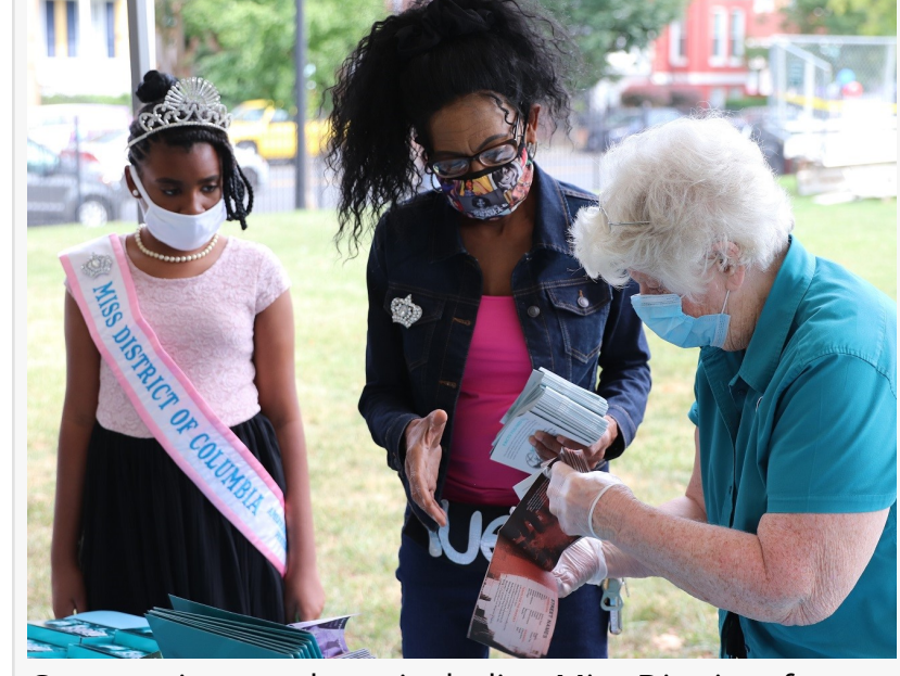
Community members, including Miss District of Columbia, take extra booklets to give to others

Drug-Free World offers all its educational materials for free. Materials can be ordered at