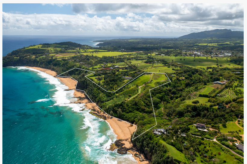
Secret Beach | North Shore, Kauai, HI | Listed for $50M

kick off in September with the auction of Secret Beach, a 34±acre estate spanning two-thirds of a mile of private and direct-access beachfront in Kaua'i, Hawaii, listed for $50 million and selling No Reserve, to the highest bidder.