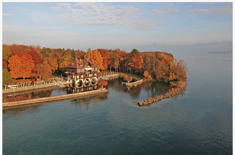
SOLD | Listed for CHF50M | Chateau de Promenthoux | Geneva, Switzerland

To find out more about how your property or listing could be considered for the sale, call 212.984.3890 or visit Fall-Auction.com . The deadlines to sign are August 20th for September bidding, September 10th for October bidding, and October 15th for November bidding. See