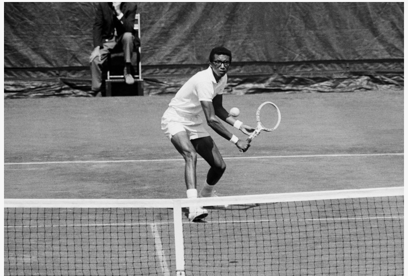
Arthur Ashe plays at US Open in Forest Hills, New York on Sept. 9, 1968, which he ultimately won.

Ashe rose from segregation and racial roadblocks to become the first African American male to win the US Open (1968), Australian Open (1970), and Wimbledon (1975). He left a wake of humanity and social activism when AIDS took his life in 1993.