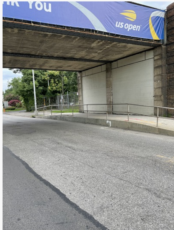
Proposed site for mural dedicated to Arthur Ashe at Flushing Meadows Corona Park in New York.