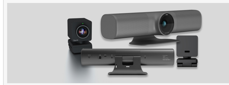
VDO360 NavAl and TridentAl Auto-Framing Cameras

Visit vdo360.com to find out more about their camera solutions and, as always, reach out to Pat Cassella (pat@vdo360.com) for any questions about which cameras are right for your distance learning needs.