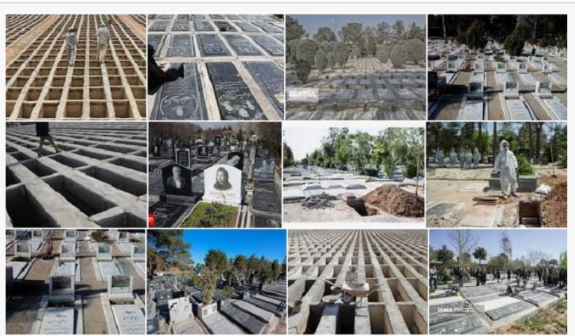
(NCRI) and (PMOI / MEK Iran): Behesht-e Zahra Cemetery's CEO, The COVID-19 mortality peak in Tehran is rising steeply.

Mrs. Maryam Rajavi , the President-elect of the National Council of Resistance of Iran (NCRI): The