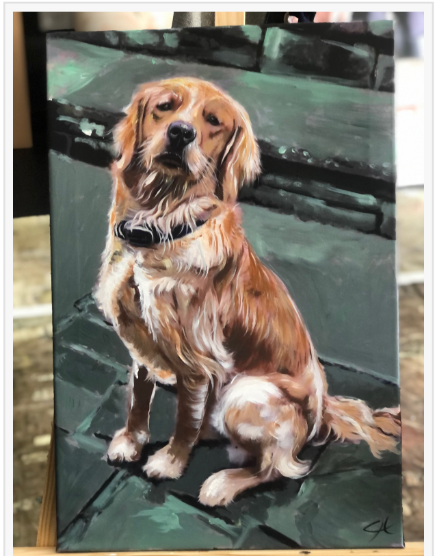
Bear - the hairiest retriever