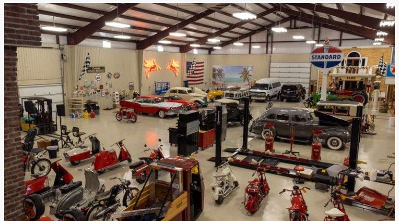
2617 Main St, Perryton, TX, 79070