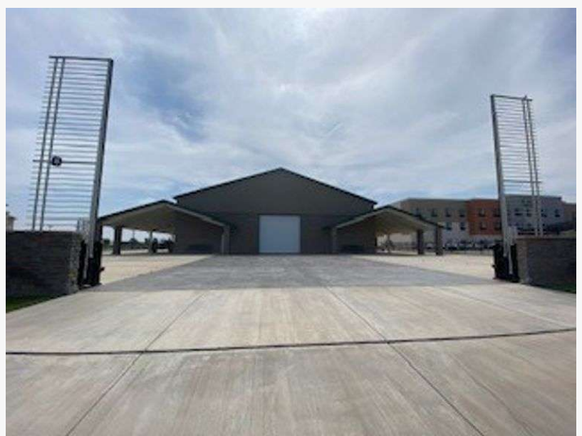
2617 Main St, Perryton, TX, 79070

Ryan Rickles Assiter Auctioneers +1 806-584-8954 info@assiter.com