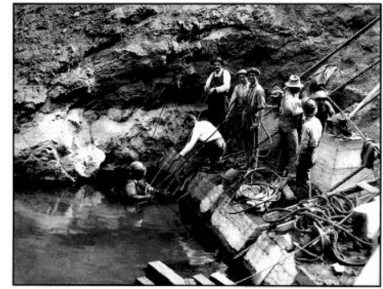
Figure 29. Construction of COPCO No. 1 in 1917.

The California-Oregon Power Company incorporated on December 15, 1911, to acquire and consolidate with other properties the holdings of the Siskiyou Power and Light Company. At the time of COPCO's formation, Siskiyou Power had already commenced construction of Klamath River Dam No. 1 (COPCO No. 1). Engineers were compelled to abandon the initial dam site at the head of Ward's Canyon and move it 1,000 feet downstream to gain more solid rock for the north abutment. Work on the new dam started simultaneously at another site farther down the Klamath (Boyle 1976:10, 14).