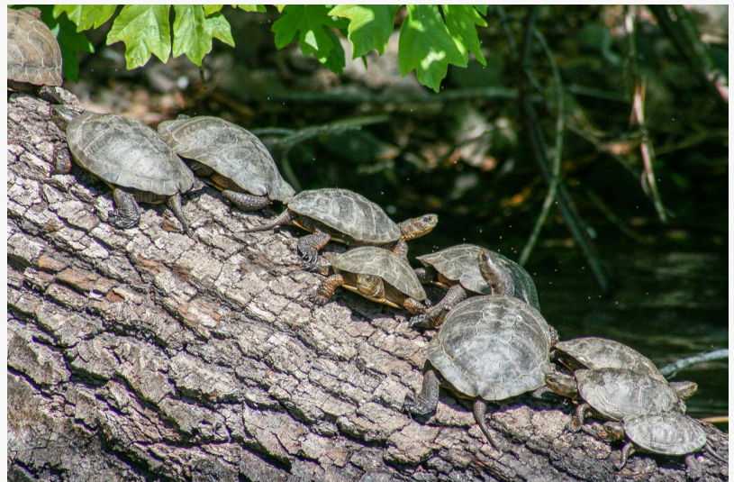
Copco and Iron Gate Lakes on the Klamath River provide critical habitat for numerous threatened and endangered species, as well as species of special concern, like these Western Pond Turtles.

These issues are direct, predictable effects of dam removal. With California and Oregon taxpayers now acting as a liability shield for PacifiCorp, it would be inexcusable for the Commission to allow this project to go forward without a significant increase in committed funds. Further, the EIS must include potential downriver impacts this sediment has all the way to