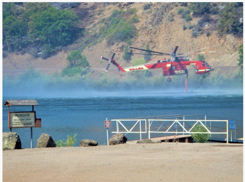
Firefighters drew over 1-million gallons of water from Iron Gate Lake (one of the lakes behind the Klamath River dams) to fight the 38,000-acre Klamathon Fire that threatened Ashland Oregon and the Cascade-Siskiyou National Monument

The Department of the Interior's liability report identifies seven additional unquantifiable liabilities associated with the sediment behind J.C. Boyle, Copco 1, and Iron Gate dams which are as having the highest potential for unexpected costs (5). In 2009, the complete clean up of this sediment was estimated to cost more than $4 billion. Sediment issues become even more severe (6) and likely to cause mass fish mortality during dry water years, which the entire Klamath Basin has faced in 2020 and 2021.