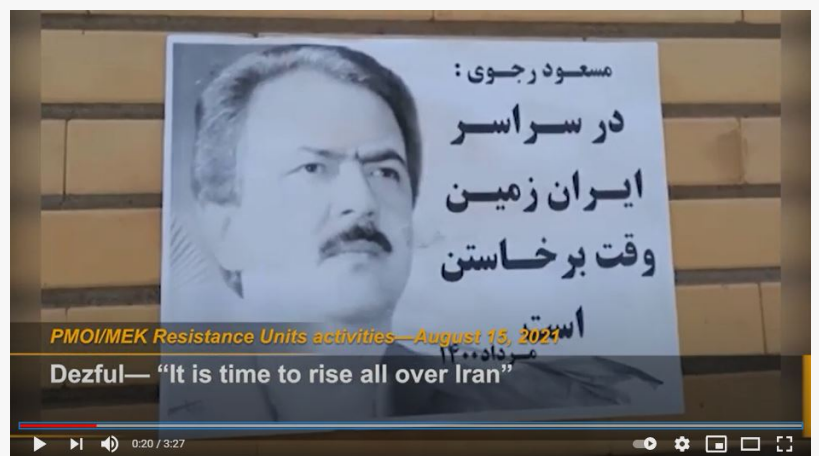
(PMOI / MEK Iran) and (NCRI): Dezful— “It is time to rise all over Iran”