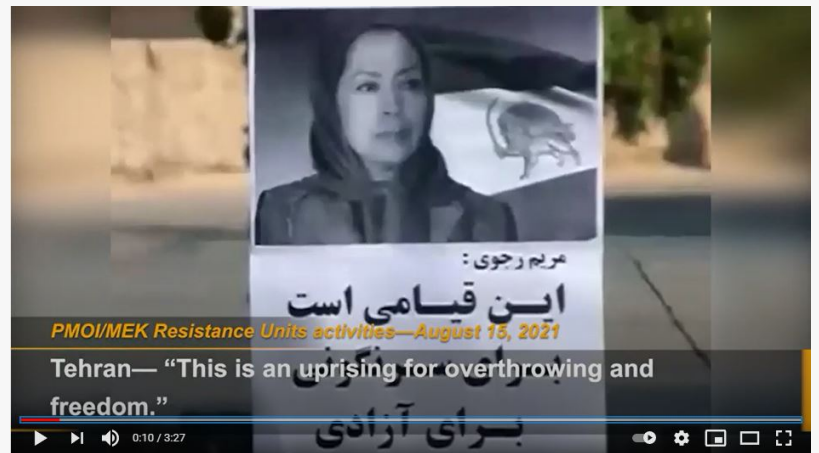
(PMOI / MEK Iran) and (NCRI): Tehran— “This is an uprising for overthrowing and freedom.”