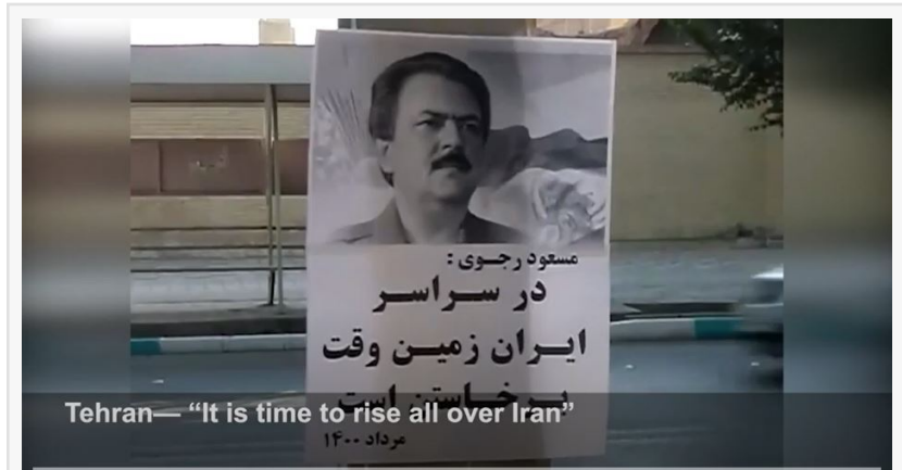
(PMOI / MEK Iran) and (NCRI): Tehran— “It is time to rise all over Iran”.

These anti-regime campaigns are carried out while the regime tries to intensify repression with Ebrahim Raisi who has a brutal record and history.