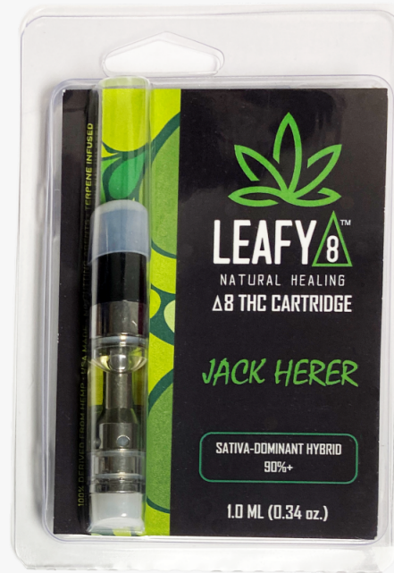
Leafy8 Brand Jack Herer Delta 8 THC Vape Cartridge

If you are in Florida, you are fortunate because delta 8 THC is legal in the state of Florida. You can purchase delta 8 THC products legally almost anywhere in the Sunshine State. However, before you make your first purchase, you should take some time to learn about the laws that govern the sale and consumption of delta 8 THC in Florida.