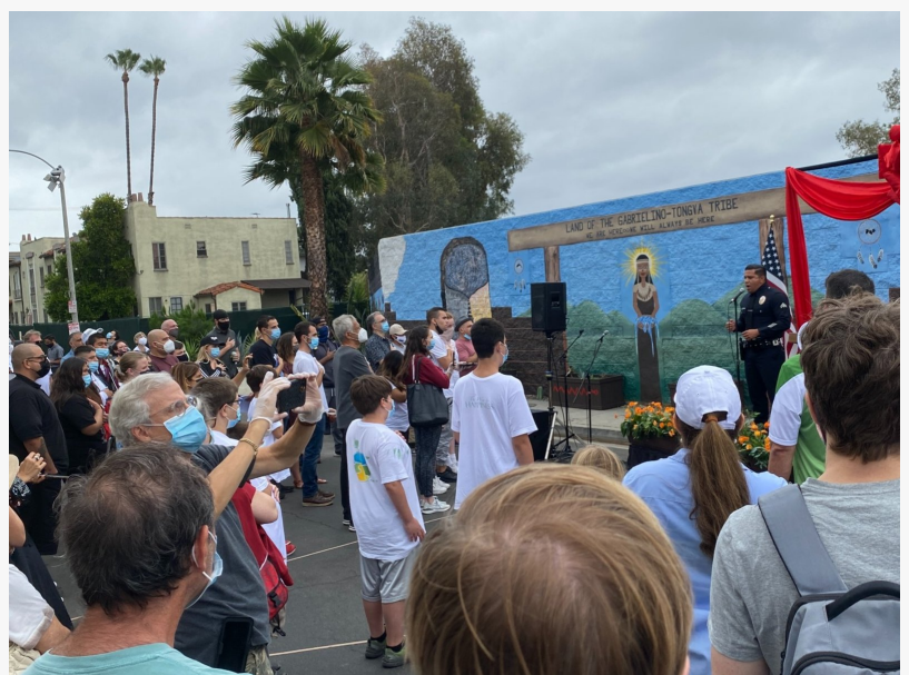
Crowd gathers for the dedication of Hollywood's Village mural August 21.

Reyes’ task was to restore a mural created 30 years ago on the barrier wall that separates the 101 Freeway from the north side of Hollywood. Located on Tamarind Avenue, the mural, known as “Hollywood’s Village” has become a tourist attraction and JPMurals’