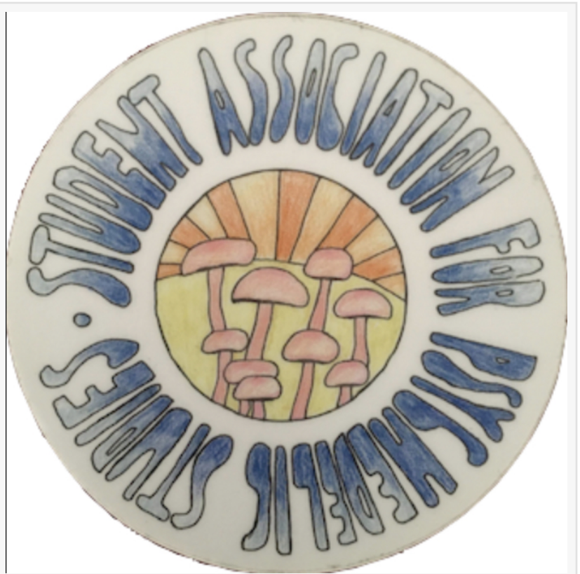
The logo for U of M’s Student Association for Psychedelic Studies