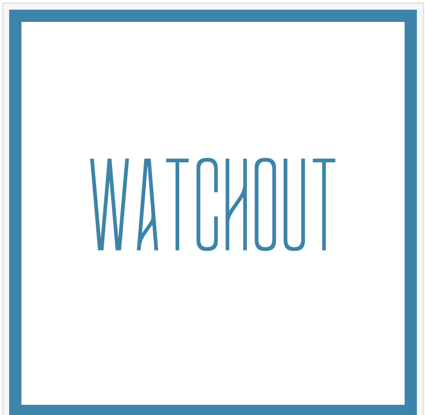
Our Great Logo

WATCHOUT SUGGESTS: REFUSE SEX TO THOSE THAT REFUSE THE VACCINE. IT MIGHT WORK.