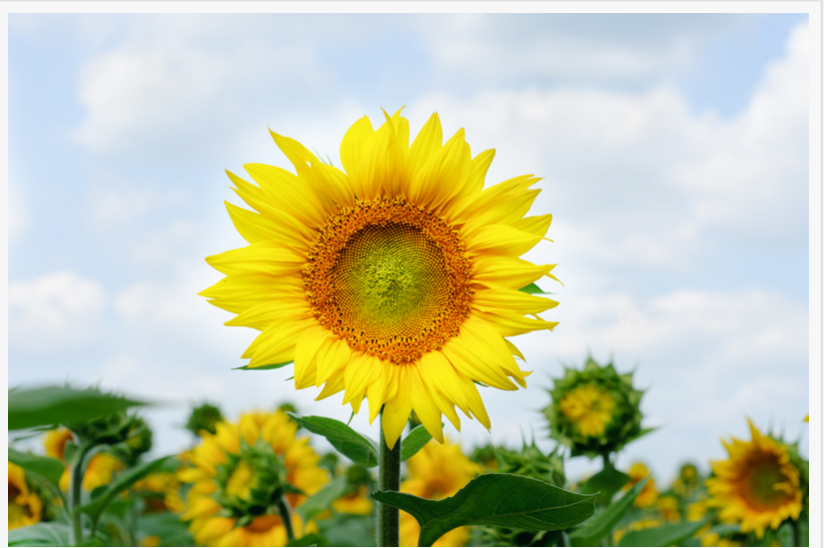
Sunflowers Add Uniqueness To The Wedding

Readers often go to soulmatetwinflame.com to learn more about themselves and love. The owners of the website say that anyone can learn more about soulmates by reading books and articles on the topic.