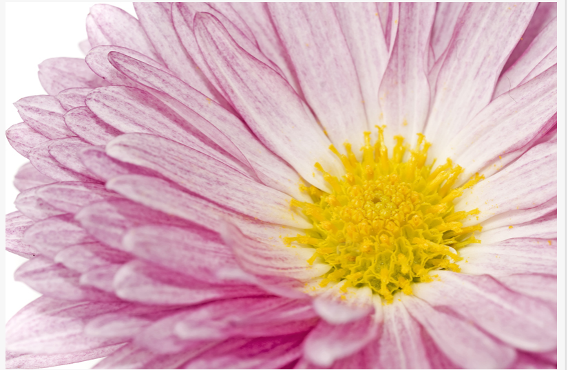
Chrysanthemum For Wedding Days