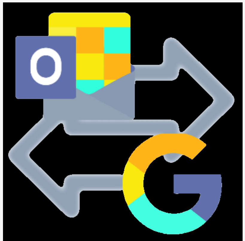
DejaFlow Connects Google Calendar with Outlook Calendar