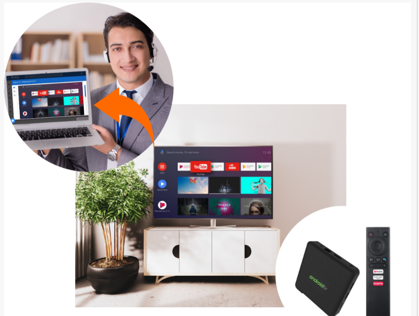
radix android tv manager - real-time support