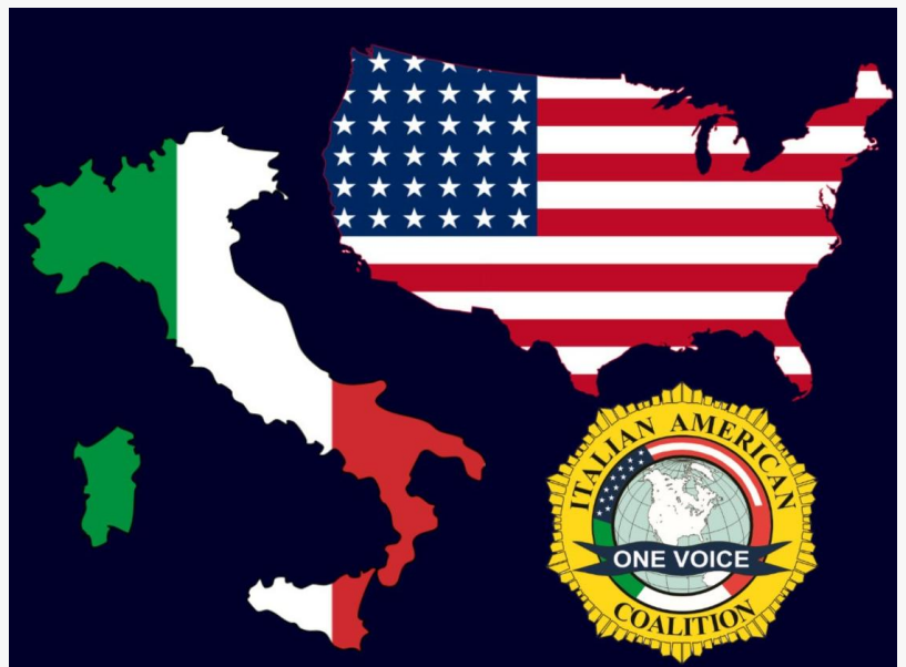
Italians Support Italian Americans Defending Columbus

civilization which developed on the American continent on 12 October 1492 with the discovery of the new world.... (this motion is) to show solidarity and closeness to all Italians and Americans of Italian origin in the face of attempts to criminalize and humiliate their own history and