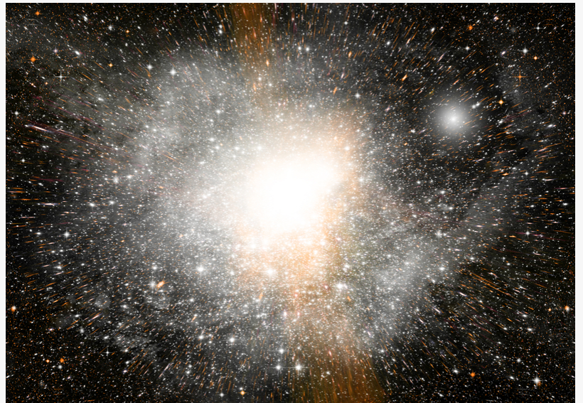
Getting Into Astrology Means Something New